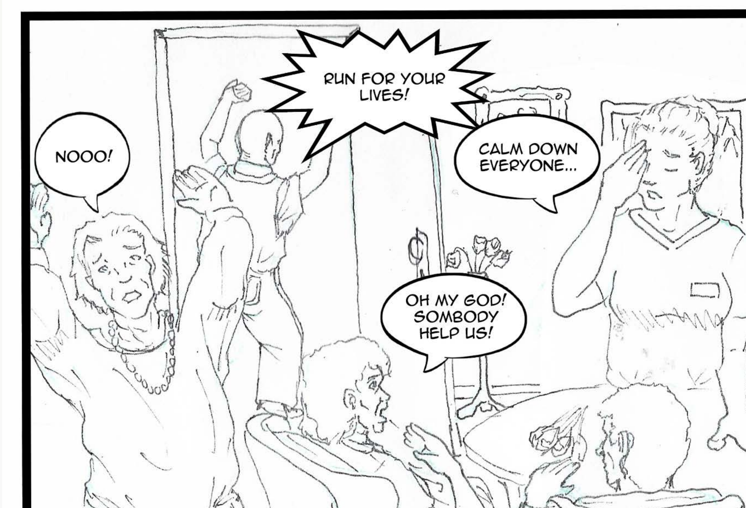
Student experience with Dementia care